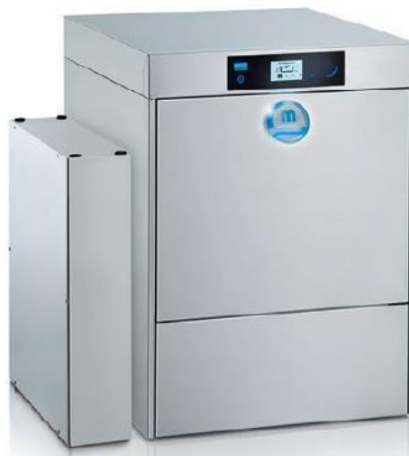
Gio Module (separately) Dimensions: 600 x 820 x 680 mm

Fresh water line: Soft cold water 0-3 °dH 3-phase current: 3N PE 400V 50Hz