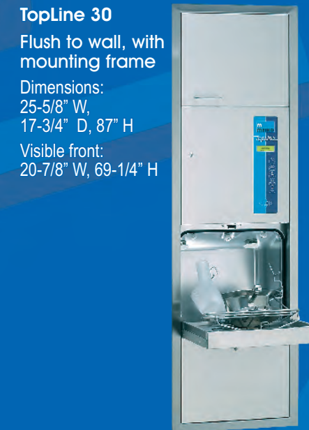
TopLine 30 Flush to wall, with mounting frame Dimensions: 25-5/8" W, 17-3/4" D, 87" H Visible front: 20-7/8" W, 69-1/4" H