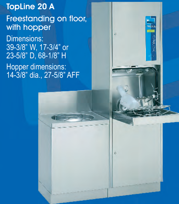
TopLine 20 A Freestanding on floor, with hopper Dimensions: 39-3/8" W, 17-3/4" or 23-5/8" D, 68-1/8" H Hopper dimensions: 14-3/8" dia., 27-5/8" AFF