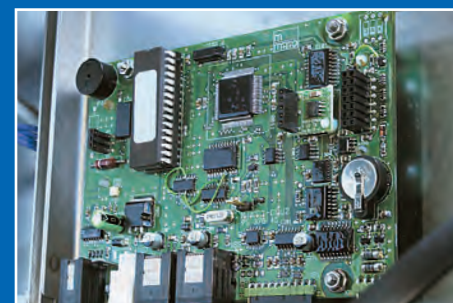
MIKE 2 microprocessor control