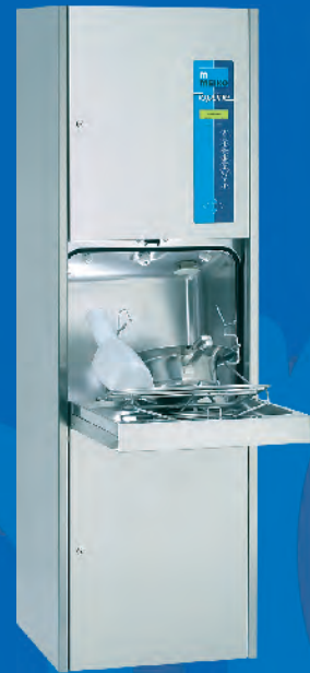
TopLine 10 Clear-of-the-floor wall mounting Dimensions: 19-5/8" W, 17-3/4" or 23-5/8" D, 64-1/8" H (plus clearance under machine)

All appliances are shipped from the factory ready for connection to utility supplies, for quick and easy installation.