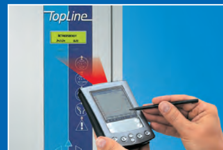
Infrared interface for Palm® PDA