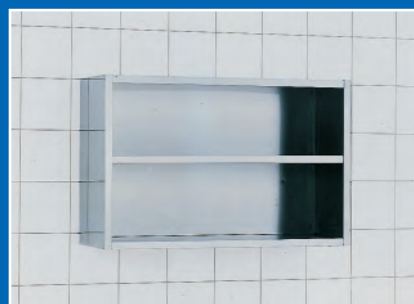
Open wall cabinet Includes 1 (one) centered shelf. Length 19-5/8", 39-3/8" or 47-1/4".