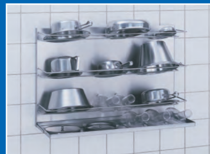
Shelf model TS For bed pans and utensils, with storage rack or trough. Length 19-5/8" or 27-1/2".