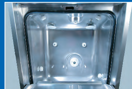
Deep-drawn stainless steel wash chamber