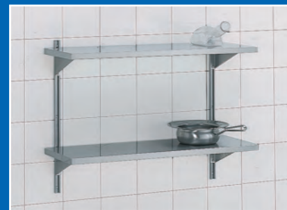
Wall shelf Adjustable height and various lengths. Depth 13-3/4".