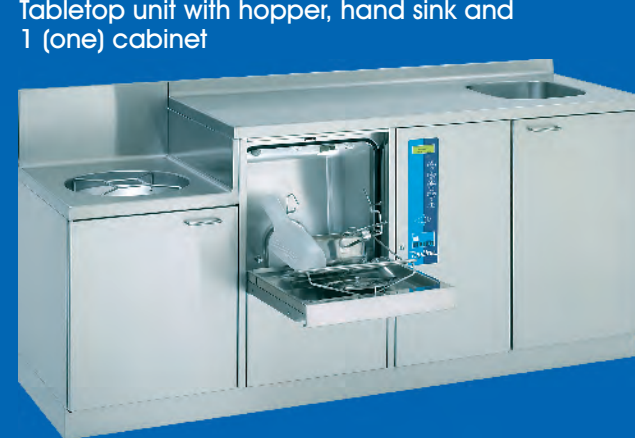
SAN TopLine 19 B Tabletop unit with hopper, hand sink and 1 (one) cabinet Dimensions: 74-3/4" W, 23-5/8" D, 35-1/2" H Hopper dimensions: 14-3/8" dia., 27-5/8" AFF Hand sink dimensions: 13-3/8" x 14-1/2" x 5-5/8" D Cabinet: 19-5/8" W