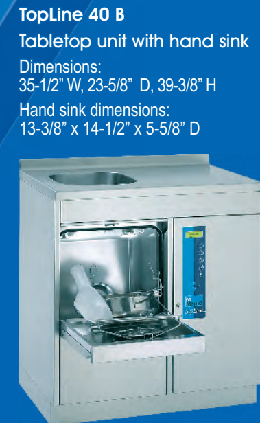
TopLine 40 B Tabletop unit with hand sink Dimensions: 35-1/2" W, 23-5/8" D, 39-3/8" H Hand sink dimensions: 13-3/8" x 14-1/2" x 5-5/8" D