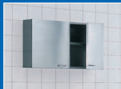
Closed wall cabinet Hinged doors. Includes 1 (one) centered shelf. Length 19-5/8", 39-3/8" or 59".