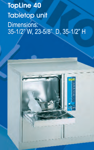
TopLine 40 Tabletop unit Dimensions: 35-1/2" W, 23-5/8" D, 35-1/2" H