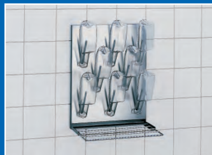
Shelf model TU For urine bottles, with storage rack or trough. Length 19-5/8" or 27-1/2".