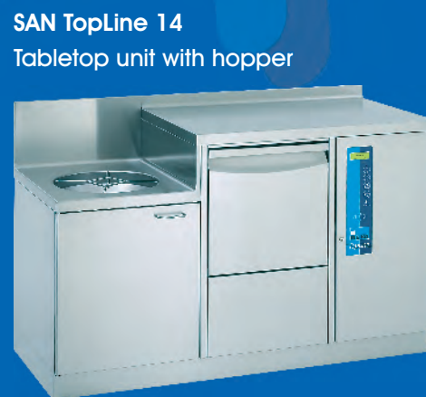
SAN TopLine 14 Tabletop unit with hopper Dimensions: 55-1/8" W, 23-5/8" D, 35-1/2" H Hopper dimensions: 14-3/8" dia., 27-5/8" AFF