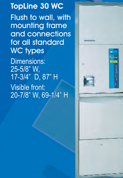
TopLine 30 WC Flush to wall, with mounting frame and connections for all standard WC types Dimensions: 25-5/8" W, 17-3/4" D, 87" H Visible front: 20-7/8" W, 69-1/4" H