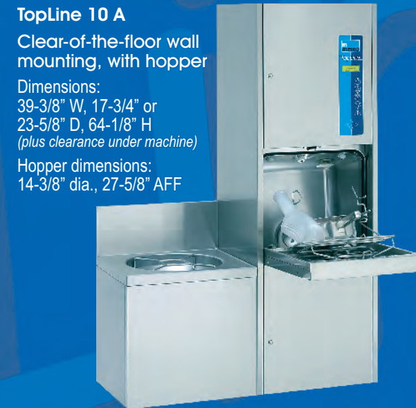
TopLine 10 A Clear-of-the-floor wall mounting, with hopper Dimensions: 39-3/8" W, 17-3/4" or 23-5/8" D, 64-1/8" H (plus clearance under machine) Hopper dimensions: 14-3/8" dia., 27-5/8" AFF