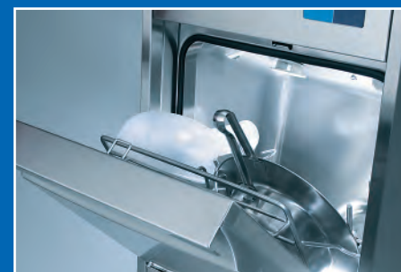
Steam-tight door with interlock