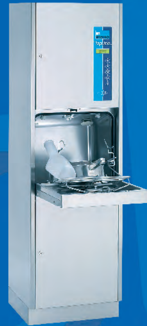
TopLine 20 Freestanding on floor Dimensions: 19-5/8" W, 17-3/4" or 23-5/8" D, 68-1/8" H