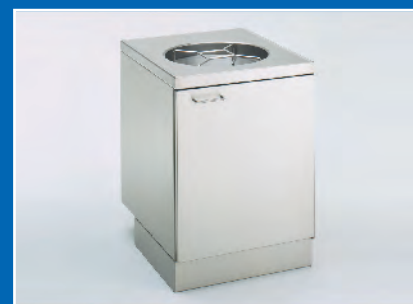
Hopper Standard freestanding-on-floor installation. 14-3/8" dia., 27-5/8" AFF.