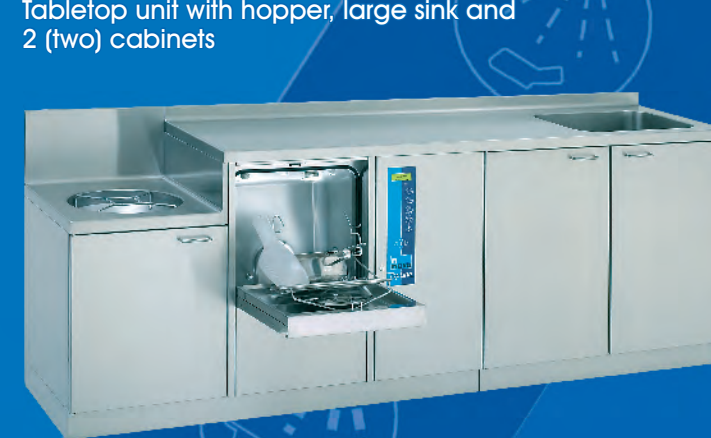
SAN TopLine 24 W Tabletop unit with hopper, large sink and 2 (two) cabinets Dimensions: 94-1/2" W, 23-5/8" D, 35-1/2" H Hopper dimensions: 14-3/8" dia., 27-5/8" AFF Large sink dimensions: 19-5/8" x 15-3/4" x 11-3/4" D Cabinet: 39-3/8" W