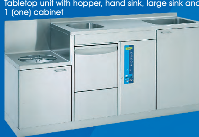
SAN TopLine 20 BW Tabletop unit with hopper, hand sink, large sink and 1 (one) cabinet Dimensions: 78-3/4" W, 23-5/8" D, 39-3/8" H Hopper dimensions: 14-3/8" dia., 27-5/8" AFF Hand sink dimensions: 13-3/8" x 14-1/2" x 5-5/8" D Large sink dimensions: 19-5/8" x 15-3/4" x 11-3/4" D Cabinet: 19-5/8" W