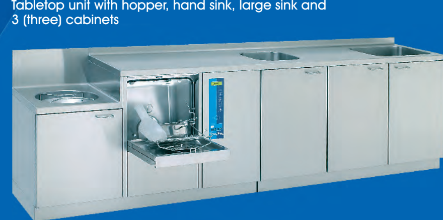
SAN TopLine 29 BW Tabletop unit with hopper, hand sink, large sink and 3 (three) cabinets Dimensions: 114-1/4" W, 23-5/8" D, 35-1/2" H Hopper dimensions: 14-3/8" dia., 27-5/8" AFF Hand sink dimensions: 13-3/8" x 14-1/2" x 5-5/8" D Large sink dimensions: 19-5/8" x 15-3/4" x 11-3/4" D Cabinet: 59" W