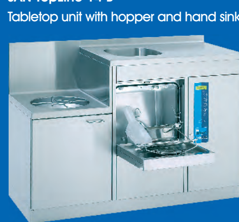
SAN TopLine 14 B Tabletop unit with hopper and hand sink Dimensions: 55-1/8" W, 23-5/8" D, 39-3/8" H Hopper dimensions: 14-3/8" dia., 27-5/8" AFF Hand sink dimensions: 13-3/8" x 14-1/2" x 5-5/8" D