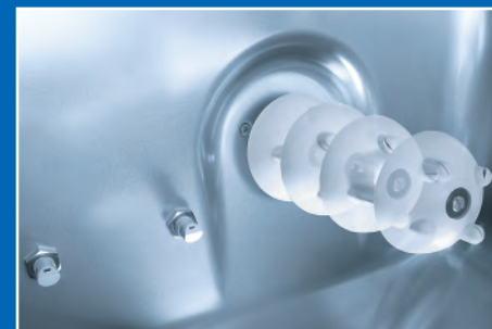
Telescopic rotary wash nozzle with nine auxiliary nozzles